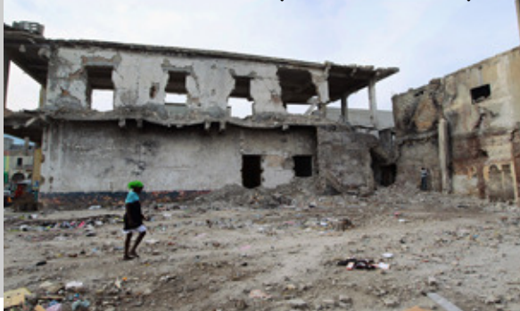
PAP school devastated by the 2010 earthquake

Last week a large generator in the secondary school that several of the older children from My Father's House orphanage attend, trembled and shook when it started in the morning. The rumble shook the entire school, causing the children to believe that another earthquake was shaking Haiti.